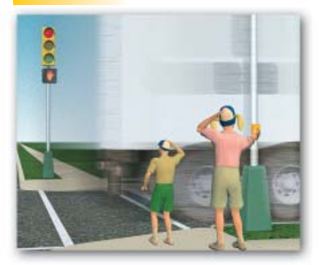
Stop. Look left-right-left. Wait for the WALK signal, or push button to turn on pedestrian activated overhead flashing amber lights if available.