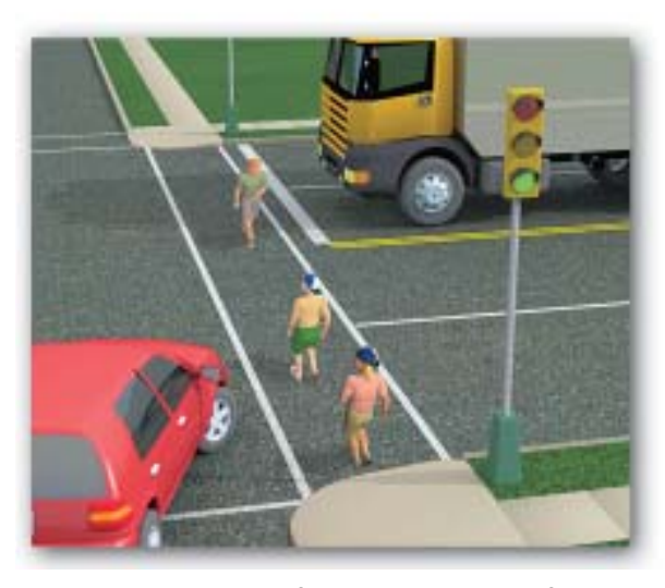
Cross and keep looking for moving cars. Watch for turning vehicles.

Do not begin to cross when the flashing red hand is displayed but you may finish crossing if it comes on while you are in the crosswalk.