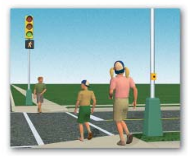
When the WALK signal comes on place only one foot into the crosswalk. Make eye contact with drivers and wait for cars to stop.

Do not begin to cross when the flashing red hand is displayed but you may finish crossing if it comes on while you are in the crosswalk.