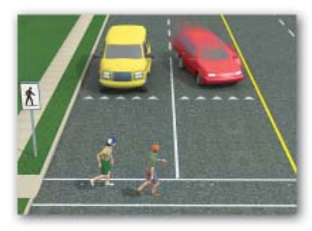
Never pass stopped or slowing vehicles at crosswalks. Exert care on multi-lane roads.

A project funded by the Road Safety Advisory Committee (RSAC) established by the Nova Scotia Department of Transportation & Public Works, Department of Justice and Service Nova Scotia & Municipal Relations partnering with the Office of Health Promotion and other provincial and municipal government agencies, municipal police forces, RCMP and other organizations interested in promoting road safety in Nova Scotia. For additional information please contact: RSAC Coordinator,