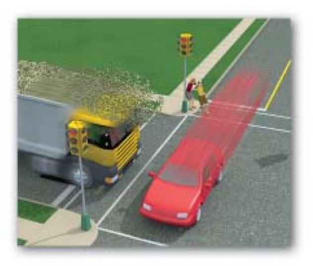
Watch for cars that don't stop. Not all drivers obey traffic signals.

Crosswalks and traffic signals don't stop cars! The WALK signal does not mean it is safe to cross. It only means it is your turn to cross.