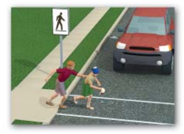
Be alert for children using crosswalks. They often dart out into traffic.

This brochure was adapted from one prepared by the Center for Education & Research in Safety (www.cers-safety.com).