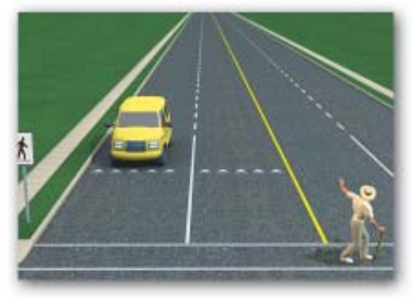
Wait until pedestrians have completely crossed the road before proceeding.

This brochure was adapted from one prepared by the Center for Education & Research in Safety (www.cers-safety.com).