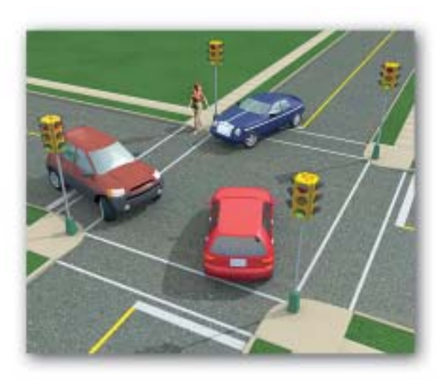
Watch for turning vehicles. Keep watching as you cross. Thank drivers with a wave and a smile.