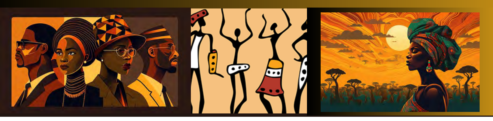
In partnership with the