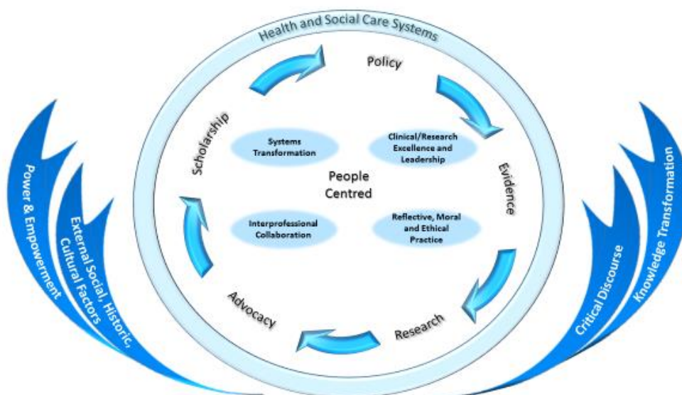
Figure 1: Curriculum Framework of the Graduate Nursing Programs at Dalhousie University