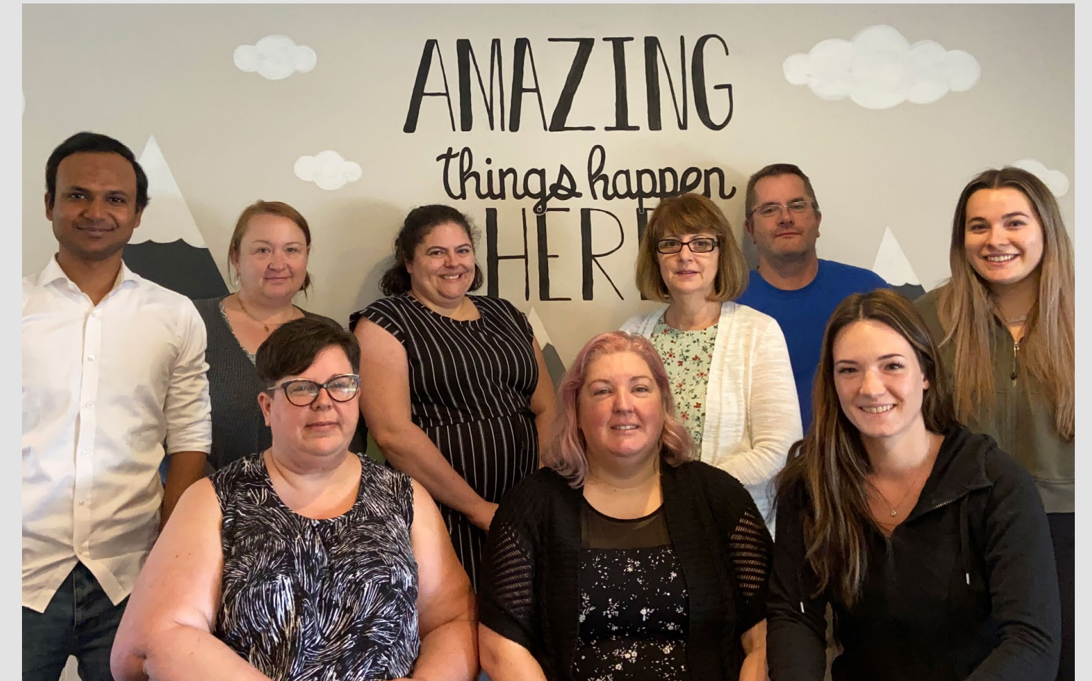
MASTER OF DIGITAL INNOVATION CO-OP