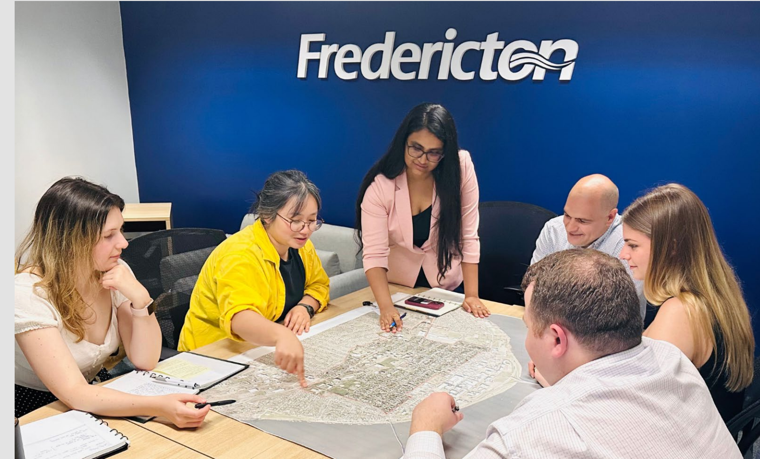
MASTER OF PLANNING CO-OP