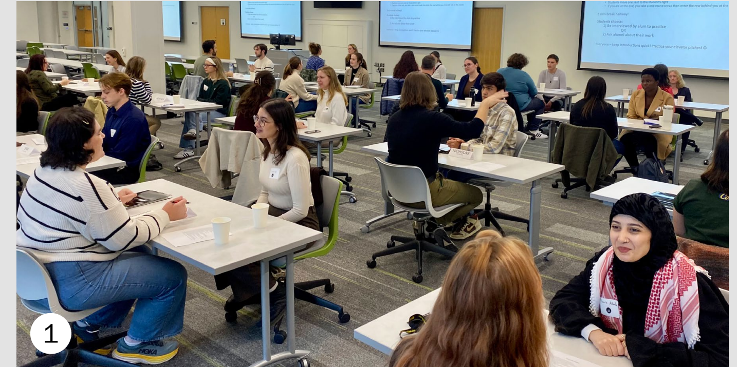
1. MREM Speed Networking Event, 2024