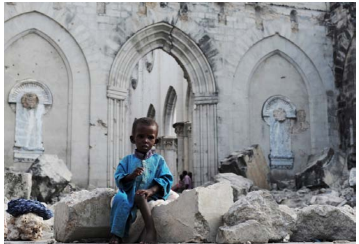
Somalia: Postcards from Hell, June 2012

of maritime piracy in this region indicate that being a failed state is a necessary, though not sufficient condition for maritime piracy. In addition to the geographical, economic and political conditions that were conducive to outbreaks of piracy, the effective cessation of Somalia as a State in 1991 also created a legal loophole for Somali pirates. While the 1982 United Nations Convention on the Law of the Seas (UNCLOS) restricts piratical activities to the high seas, criminal acts within territorial waters of Somalia were literally left unchallenged. According to the DMPP’s report on a Preliminary Survey of Piracy in The Western Indian Ocean, Gulf Of Aden And Bay Of Bengal, the prevalence of piracy in the Gulf of Aden was deemed possible because of the poor governance along much of Somalia’s coast. The study also describes Somalia as providing the pirates with many options for places to hold the captured vessels until they are released, usually following payment of a ransom. Preliminary analysis finds support in Percy and Shortland’s (2011) analysis which stated that Somalia represents the perfect collision of means (extensive small arms), motive (poverty) and opportunity (lack of governmental authority and proximity to shipping) for effective pirate operations.