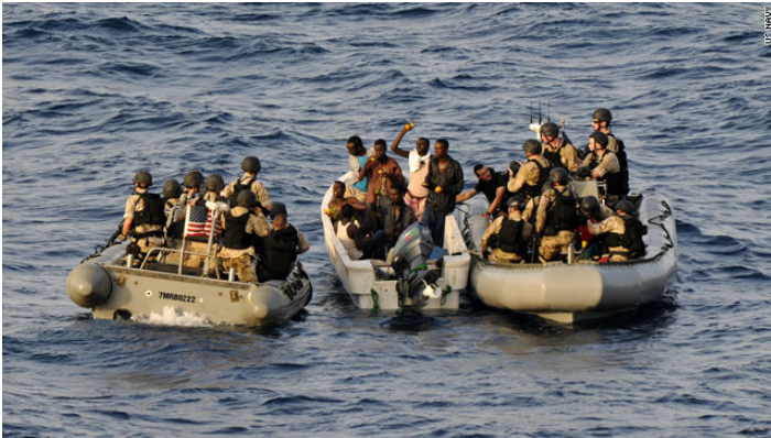
Piracy and Kidnapping in Somalia, Jan 2012

Previous discussions on weak states suggest that both the political and economic landscapes of these states differ from those of failed states. In contrast to piracy operations in the Horn of Africa, it is worthy to note that, in analyzing the maps of piratical activities, no clear linkages are indicated between the failed State of Somalia and the emergence and/or prevalence of piracy in that area, as these activities primarily cluster off the coast of Somaliland which is comparatively more stable and functioning.