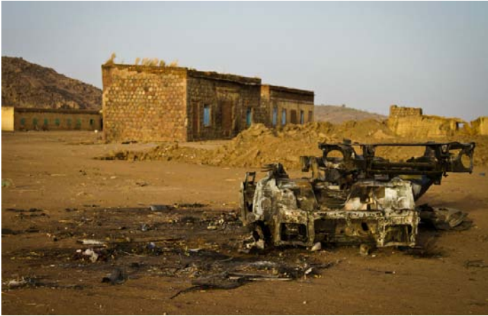
Sudan: Post Cards From Hell, June 2012

Further comparisons may also be made with some states in the West African Region, such as the Democratic Republic of Congo, Guinea and the Ivory Coast. According to the Failed State Index 2011, these countries are ranked in “critical” danger of failure with all of the remaining countries as being in “danger” of failure, except for Ghana and Benin, assessed to be within the more stable category of “borderline”.