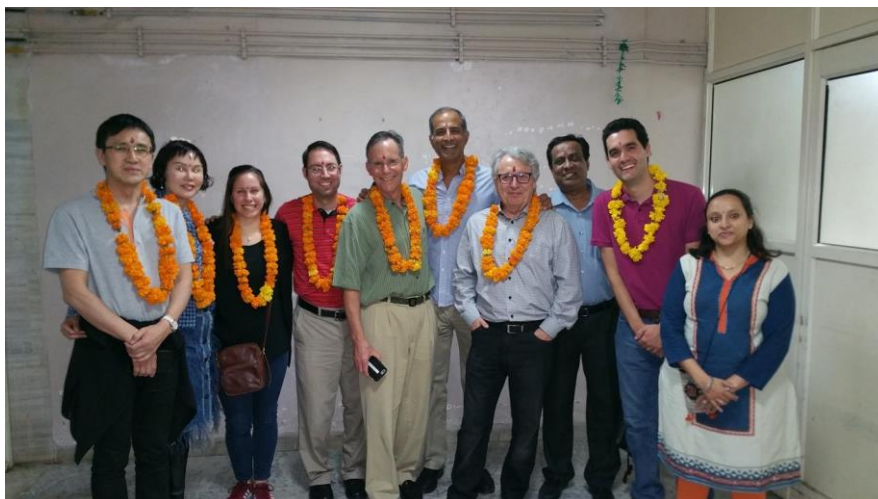
Welcome reception for pediatric urologists from different parts of the world to the India Exstrophy Collaborative Workshop