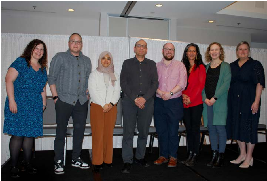
The conference chair and speakers for the 2025 W.O. McCormick Academic Day.

The 2025 W.O. McCormick Day was held on April 25 at the Atlantica Hotel.