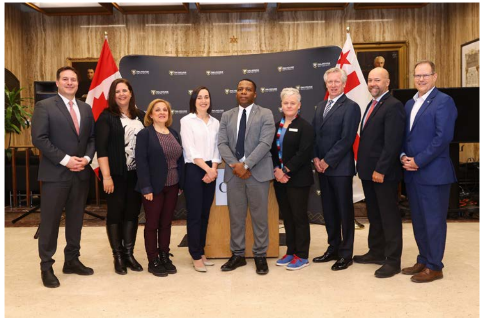
Members of parliament, Dal leadership, and researchers at the announcement on Feb. 28, 2023.