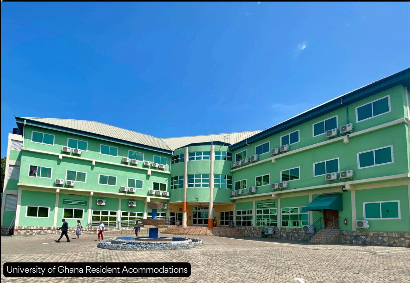
University of Ghana Resident Accommodations