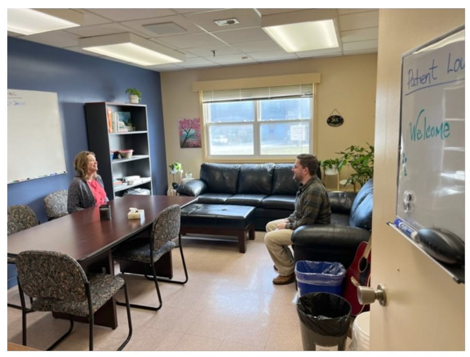
DaRT program patient lounge.

The therapeutic environment is commonly acknowledged as a significant influence on treatment experiences and outcomes. Patients with complex mental illness have unique psychological needs that require a safe environment to engage and benefit from treatment. Our therapeutic milieu (operating within the treatment groups in addition to more informal aspects of the program) is essential in providing a safe and contained setting. It is by way of this milieu and other program components that our patients can create the internal sense of belonging and trust (safety and support) necessary to engage in intensive emotion-focused and attachment-based work. Patients are encouraged to interact with group members and use what they have learned to obtain a significant clinical impact on themselves. New skills are