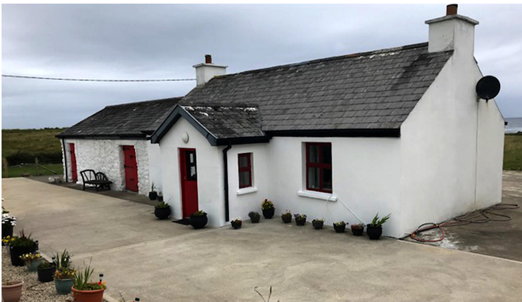
Brenda's cottage, which we eventually found!