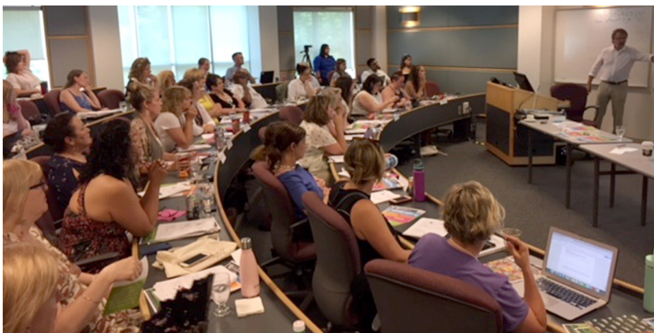
Core Training sessions held this summer welcomed attendees from Canada, the US and Wales.