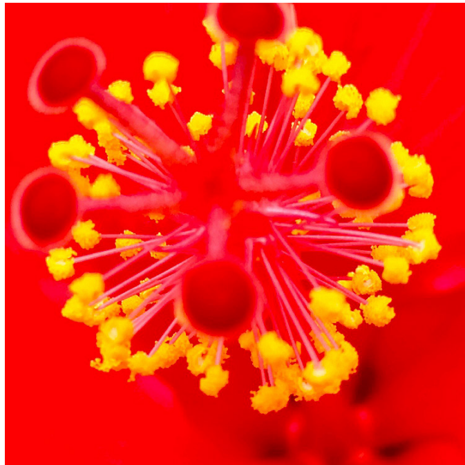
Summer's splendor.