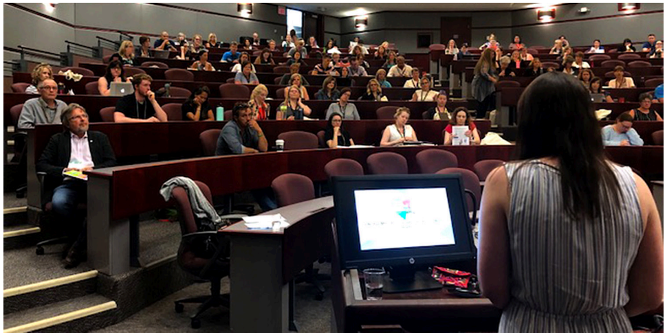
Over 150 educators and administrators gathered for this year's Mental Health Academy.

A comprehensive mental health literacy learner resource for pre-service teacher candidates and practicing teachers has recently launched through the Faculty of Education at the University of British Columbia. Teach Mental Health is a modular based, online, professional development/education resource that addresses educator mental health literacy, an area often missed in most teacher education courses. The project is a partnership of the Faculties of Education at St. Francis Xavier University, Western University, UBC, and the team at TeenMentalHealth.Org. The course is free, easily accessible and content will be available to all Faculties of Education in Canada. Teachers and other educators who are currently in schools are also welcome to take the course. Although the course