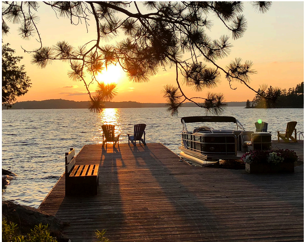
Sunset on the Muskoka, where Dr. Tibbo attended the Wasan Island International Think Tank.

The think tank tackled a number of issues including, but not limited to: how to develop a mindset within health care providers to create robust and positive contacts with individuals with psychosis; how to reduce frequency of hospital visits (what is necessary to maximize relapse prevention), establishing models