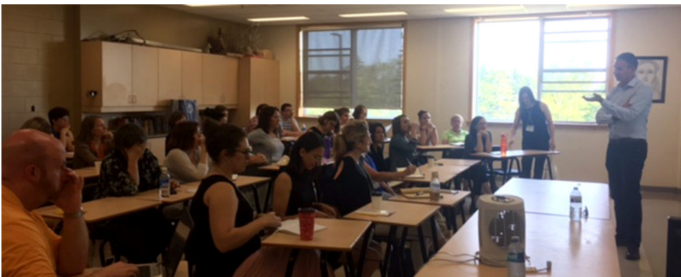
Participants taking part in one of the break-out sessions offered at this year's Mental Health Academy.