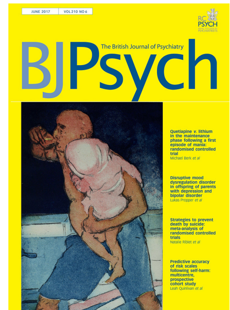
Publication Cover, The British Journal of Psychiatry, June 2017