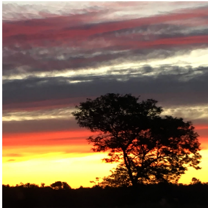
A lovely sunrise in Oxford County.