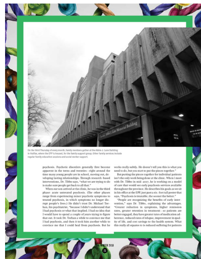
Pages from Dal Magazine featuring the Early Psychosis Program.