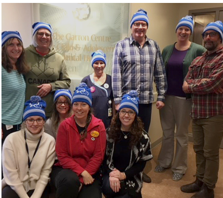
Garron Center team on Bell Let's Talk Day.

In 2018, Bell added $6,919,199 to its commitment to Canadian mental health programs through Bell Let's Talk Day.