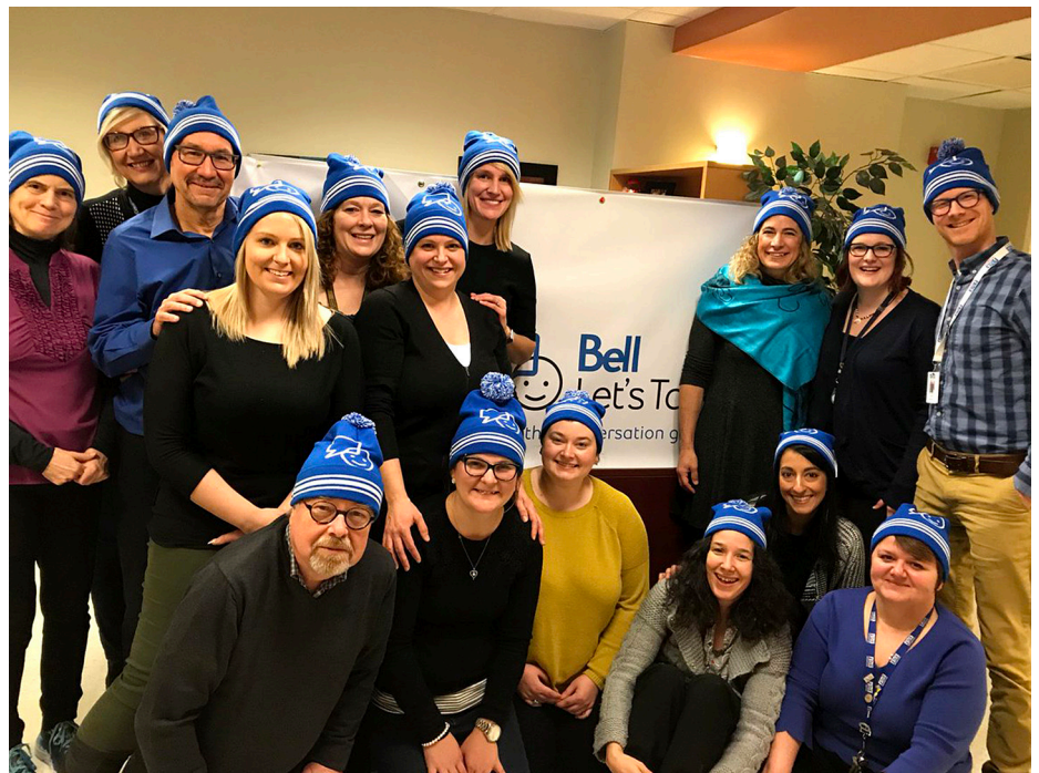
IWK 4Link Outpatient teams showing their support for mental health awareness.