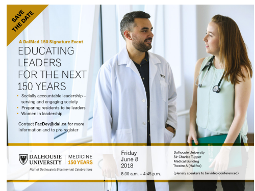
MEI education event poster