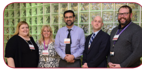
Teach the Teachers January 2018

The conference was organized by the Continuing Professional Development (CPD) Committee. The Committee was restructured this year, combining three pre-existing committees: Grand Rounds, Medicine Matters and Teach the Teachers into one Continuing Professional Development (CPD) Committee. This Committee is now responsible for organizing and overseeing all Department CPD efforts.