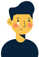
Fever (i.e. chills, sweats)