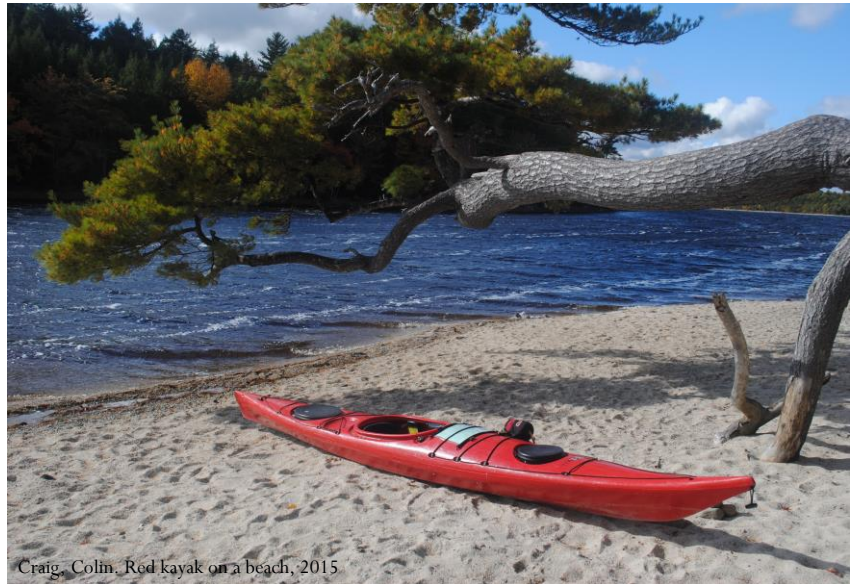
Craig, Colin. Red kayak on a beach, 2015