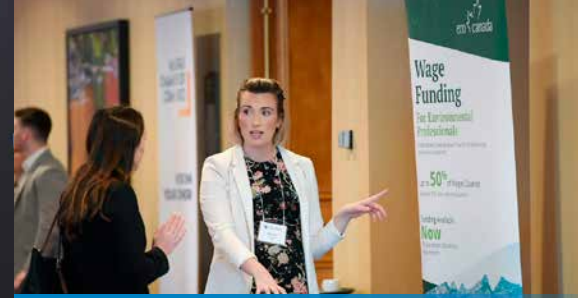
Networking at the 2019 Nova Scotia Co-operative Education Summit