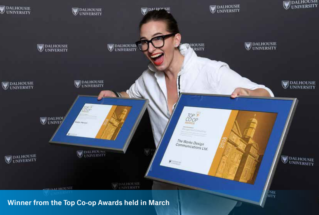
Winner from the Top Co-op Awards held in March