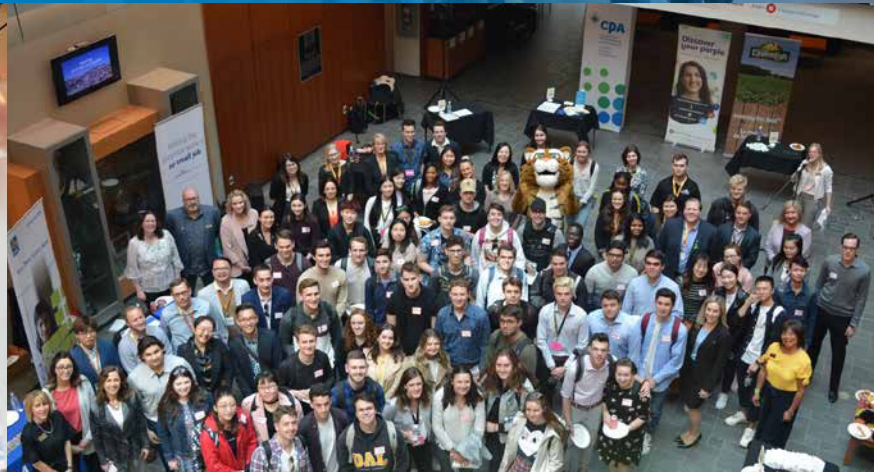
Big turnout and lots of fun at the Commerce Summer Social