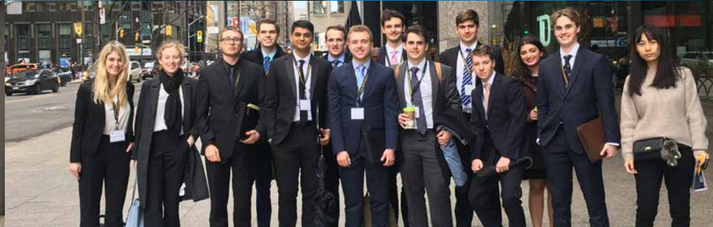
Rowe School of Business students on Bay Street for the Toronto Corporate Tour