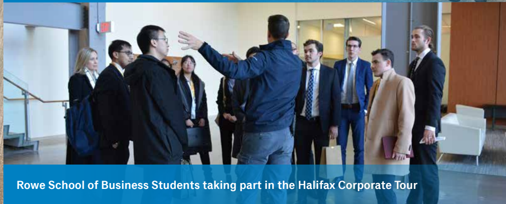
Rowe School of Business Students taking part in the Halifax Corporate Tour