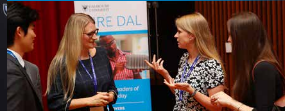
Students taking part in the Rowe Networking Night