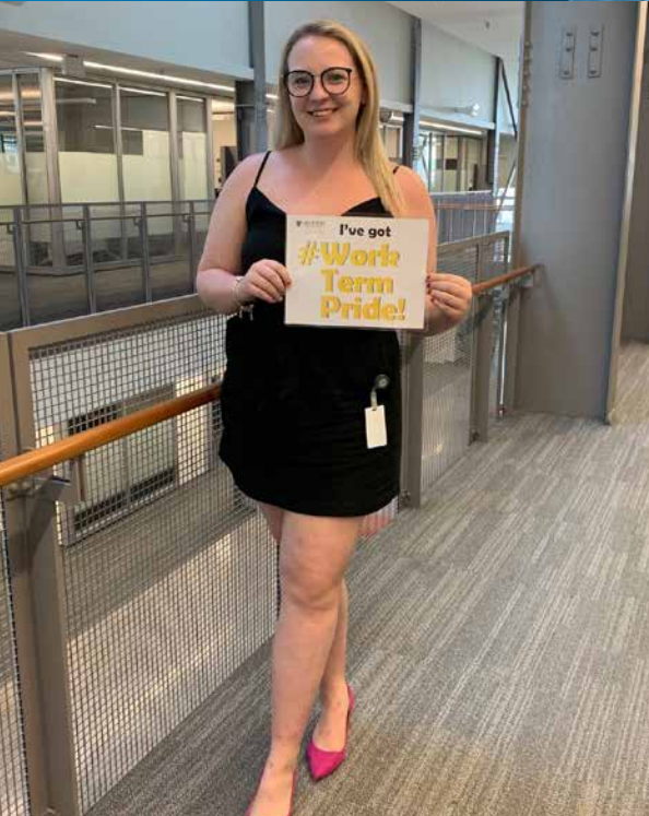
Rowe School of Business student showing her Work Term Pride