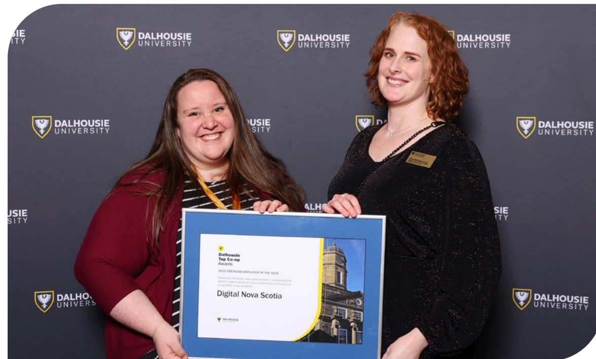
Emerging Employer of the Year: Digital Nova Scotia

92% BComm, BMgmt and CRMBA students evaluated as Very Good, Excellent, or Outstanding