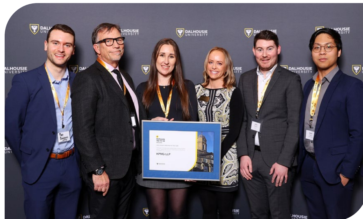
Legacy Employer of the Year: KPMG