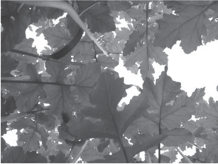
Brassica cover crops are competitive, fast growing, and can provide mulch after being winterkilled.

ing that the system is complex and its components (crops, soil, weeds, insects and microorganisms) are constantly interacting. In recognizing the complexity of the system, the farmer gains insight on many avenues to manage weeds and begins to see how every decision can adversely or favourably affect weeds. Canadian researchers, including those participating in the Organic Science Cluster (OSC), are exploring systems-based approaches to develop weed management tools and strategies.