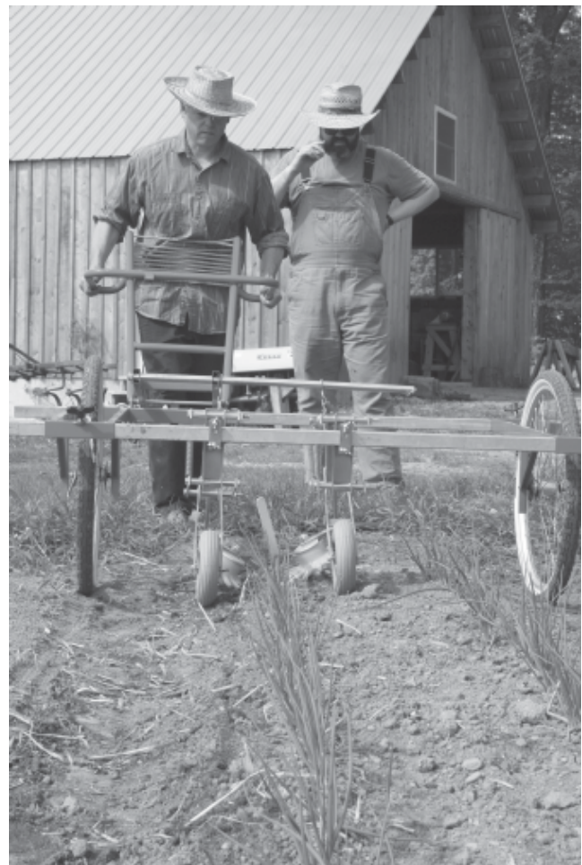
A Schmotzer cultivator, imported from Germany, cultivates barley which was sown in wide rows to permit inter-row hoeing.

Ecological weed management sounds like common sense, but somehow many farmers and gardeners are drawn to the magic bullet that will solve a