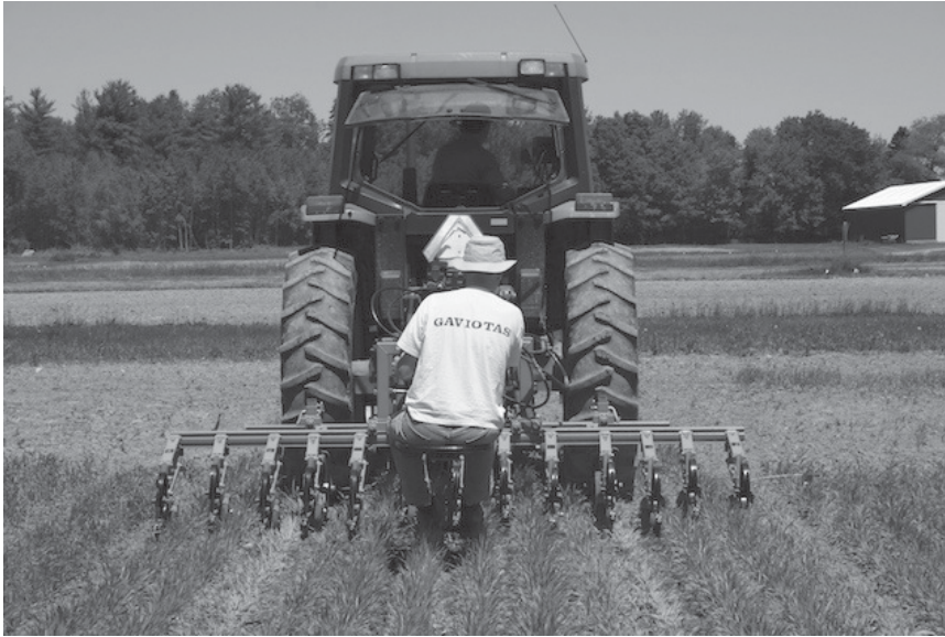
The Weed Master is an innovative set of cultivation and flame-weeding equipment, designed and built by a team of Finnish small-scale farmers. www.umaine.edu/weedecology/evaluating_the_weed_master.html