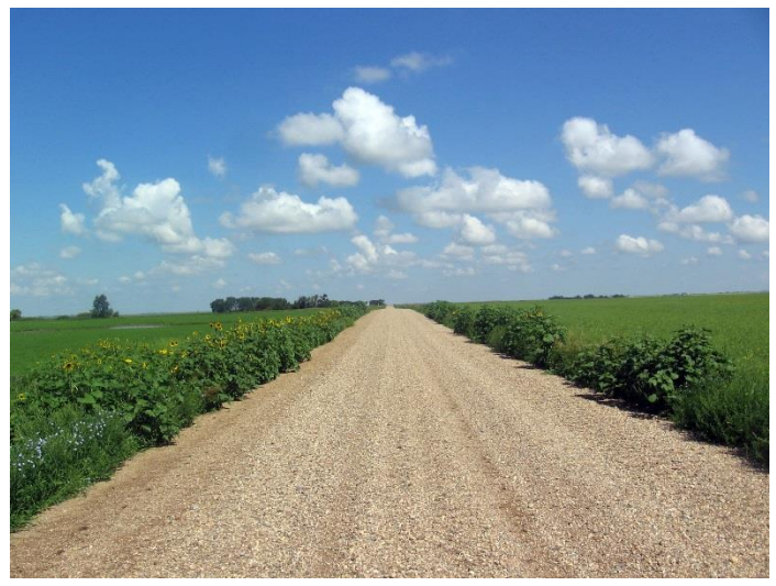
Prairie roadsides harbor a great diversity of soil microorganisms.

We also looked at the distribution of fungi in cultivated soils, native prairie and roadsides, and we found more of some fungi in certain field conditions, and other species in other situations. For instance, we found that the diversity was highest in the roadsides, which is good news because we have lots of roadsides! If we lose fungi from fields, maybe from pesticides, we can recover them from the roadsides. We also found that the native prairie and cultivated fields had about the same level of diversity, although the communities are changed. So, agriculture is not wiping out mycorrhizal fungi, but shifting the prevalence of certain types. One fungi, named Funneliformis mosseae , becomes very abundant in agricultural soil, and can actually be used as an indicator of agricultural soils.