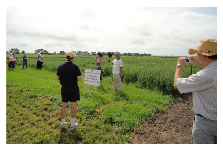
Participatory plant breeding field day.

We have scientists now who are able to really explain farming systems back to the farmer. Producers are seeing certain interactions happening in their farming systems, and they're wondering why things are happening. For instance, farmers may wonder why they are able to grow good crops even though soluble phosphorus levels are very, very low in the soil, so a typical agronomist will would suggest that they have a crisis on their hands. The soil microbiologists who work with us, and with others, are telling us that these systems remain productive because the soil biology has changed to increase the number of beneficial fungi. In that way, I think that is just as important as giving farmers a prescription of how to reduce your tillage or how to add compost to your soil. Farmers have worked out some steps themselves, but they feel a lot more confident about those steps when they know why they're actually working.