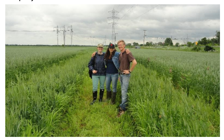
On-farm participatory breeding plots in Québec, with a participating farmer and USC Canada staff.

The farms that we're working on for the participatory plant breeding are spread from Prince Edward Island all the way to Vancouver Island. In 2014, we worked with 44 farms right across the country, in almost every province — with the exception of Newfoundland and the Territories. That is a logistical challenge, but we have a good team here to keep that all straight, and we are tying in to some regional coordinators with different NGOs to help us coordinate the project.