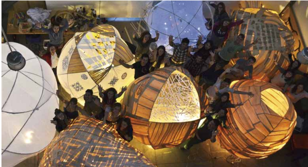
Engineering and architecture students teamed up this year for the annual Parade of Lights. Their cooperative effort won them first place for the float's creativity, use of lights and overall effect.