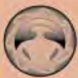
British Columbia Centre of Excellence for Women's Health

British Columbia Centre of Excellence for Women's Health BC Women's Hospital and Health Centre E311 – 4500 Oak Street Vancouver, BC Canada V6H 3N1 www.bccewh.bc.ca Tel: (604) 875-2633 Fax: (604) 875-3716 bcccewh@cw.bc.ca