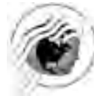
National Network on Environments and Women's Health