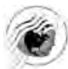
National Network on Environments and Women's Health

blinded to the possibility that sex and gender do matter—to women, and to men—and we may be advancing policies in ways that disadvantage some segments of the population. And we'll keep running—like Alice and the Red Queen—but getting nowhere fast.