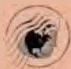
National Network on Environments and Women's Health

Prairie Women's Health Centre of Excellence 56 The Promenade Winnipeg, MB Canada R3B 3H9 www.pwhce.ca Tel: (204) 982-6630 Fax: (204) 982-6637 pwhce@uwinnipeg.ca