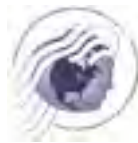
National Network on Environments and Women's Health