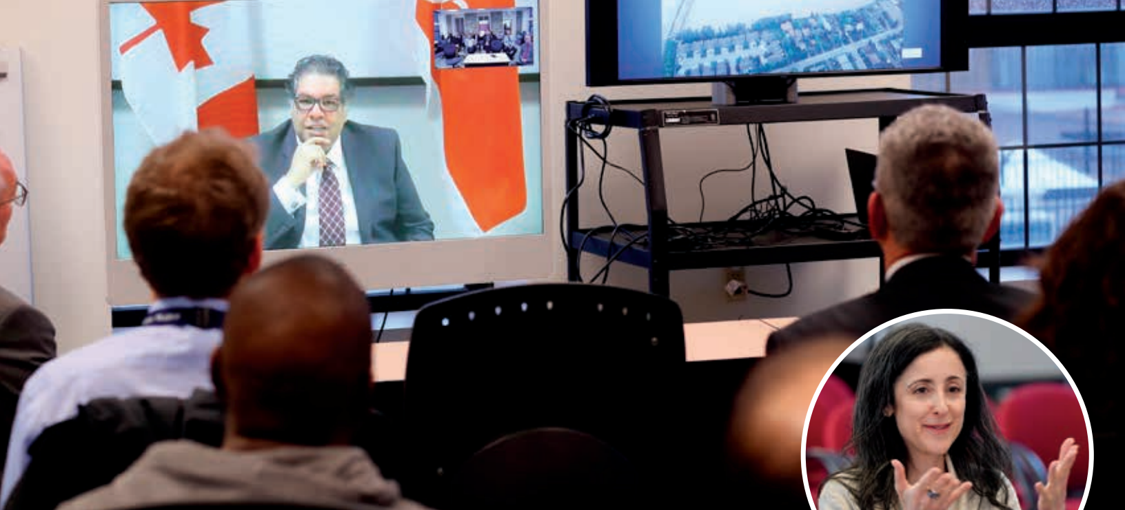
PULITZER PRIZE WINNING JOURNALIST SHERI FINK