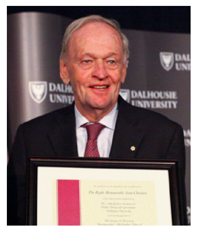
The Right Honourable Jean Chrétien Former Prime Minister of Canada