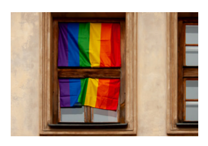
LGBTQ+ CANADIAN BABY BOOMERS IN NEED OF SAFER HOUSING IN SENIOR YEARS

MacEachen Institute fellows and staff are actively engaged in policy conversations and regularly write op-eds that are published in local and national publications.