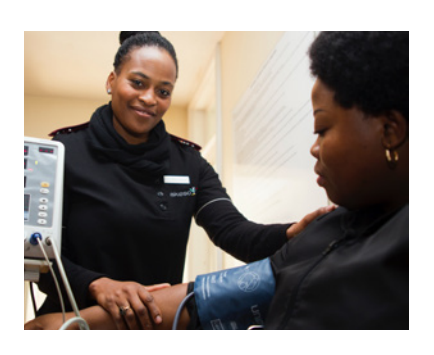
RECOGNIZING HISTORY OF BLACK NURSES: A FIRST STEP TO ADDRESSING RACISM AND DISCRIMINATION IN NURSING