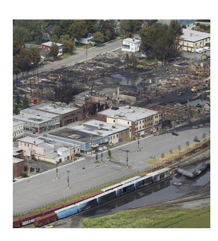
A LAC-MÉGANTIC TRIAL, BUT WHERE'S THE INQUIRY?