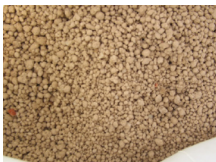
Pelletized lime is usually more expensive, but easy to apply.

Check soil pH and fertility by having your soil analyzed at least once every three years. See 'Soil science basics' for details on soil sampling.