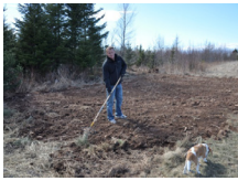
A final raking breaks up large clods and levels the soil.

Just prior to planting, break up large clods of soil and rake the bed level. Small-seeded vegetables germinate