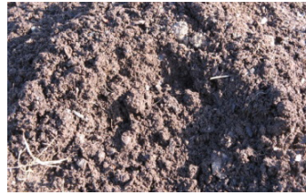
Composted manure can be purchased in bulk by a community garden or a group of gardeners.

Another source of inexpensive soil builder is the cover crop. Green manures, or cover crops, such as annual rye, ryegrass, buckwheat, and oats, are planted in the