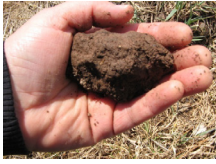
This soil stayed in a ball when it was squeezed. It is still too wet to work!

formation of a compaction layer that will inhibit root growth.