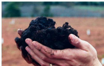
High quality compost is decomposed before it is added to the soil.

Animal manures are commonly used as a garden soil amendment. The nutrient content of manure varies. Fresh horse, sheep, rabbit, and poultry manures are quite high in nitrogen and may even burn plants if