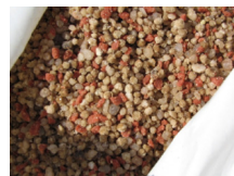
Synthetic fertilizers are concentrated sources of nutrients, but do not improve the soil's physical or biological properties.

Nutrients can be applied in the form of organic materials such as compost, manure, green manure, plant residues, and wood ash. Additional natural source supplements can be purchased at garden centers and by mail-order. These include rock phosphate, Sul-Po-Mag, seaweed, fishmeal, greensand, bone meal, blood meal and feather meal. Check product labels for the type and quantity of nutrients and how they are best applied. These natural source amendments are particularly useful where a minor element deficiency exists, while synthetic fertilizers are generally more concentrated, less expensive, and have quicker results. See 'Plant nutrition' in this guide for more information.