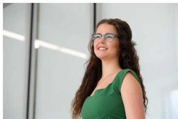
Maïke van Niekerk, 2017 (Health)