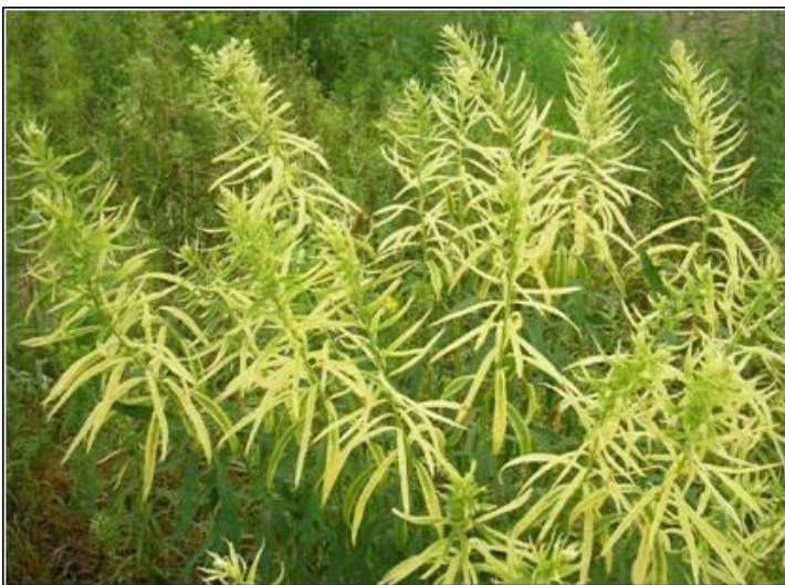
Callisto damage on goldenrod

Callisto® is generally applied as a post-emergent product (after weeds emerge) and can only be applied in sprout year wild blueberry fields. Callisto® should be applied when goldenrods are at least 10 cm tall but before flowers fully open. Goldenrods may re-establish if Callisto is applied when the shoots are very small (less than 10 cm tall). Timing can vary depending on year, but applications are generally made by mid-June. Plants will turn white and begin to die within 1-2 weeks after application. Callisto® can also be applied as a pre-emergent product (before weeds emerge), but results from research trials have been less satisfactory when compared to post-emergence applications. Callisto® is most effective when it follows a Velpar® application